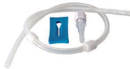
Tenckhof Adult and Pediatric Piece