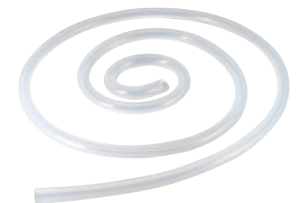
Pigtail catheter Piece