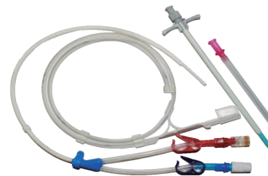
Mahurkar Adult and Pediatric Piece

Peritenck Catheter for dialysis peritoneal, chronic subcutaneous installation, with two polyester bearings Tecknoff .