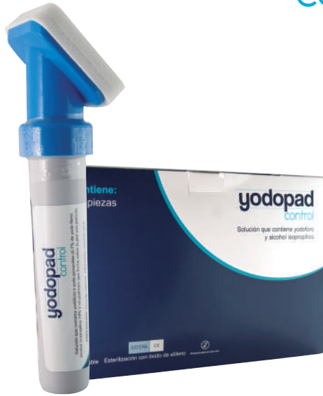
Yodopad 26 mL Box - 15 pieces

Yodopad - Control® is a solution which contains Iodophor or Yodopovacrix, served to prepare the patient's skin for surgery easily, with a practical application form and provides special care to the skin of the same.