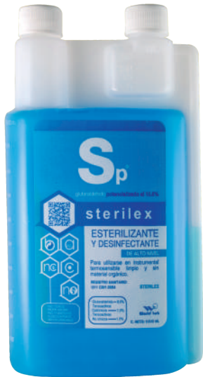
Box 1L - 6 pieces

Sterilex, sterilizing solution cold 8-12.5% of glutaraldehyde, to prepare a dilution of final use of the 2 to 3.5%.